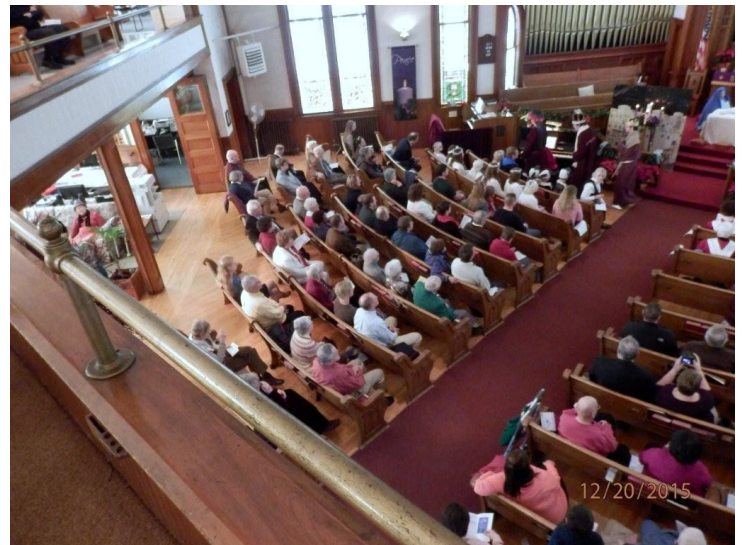
The Sanctuary was nearly full for "The Christmas Story" presentation!