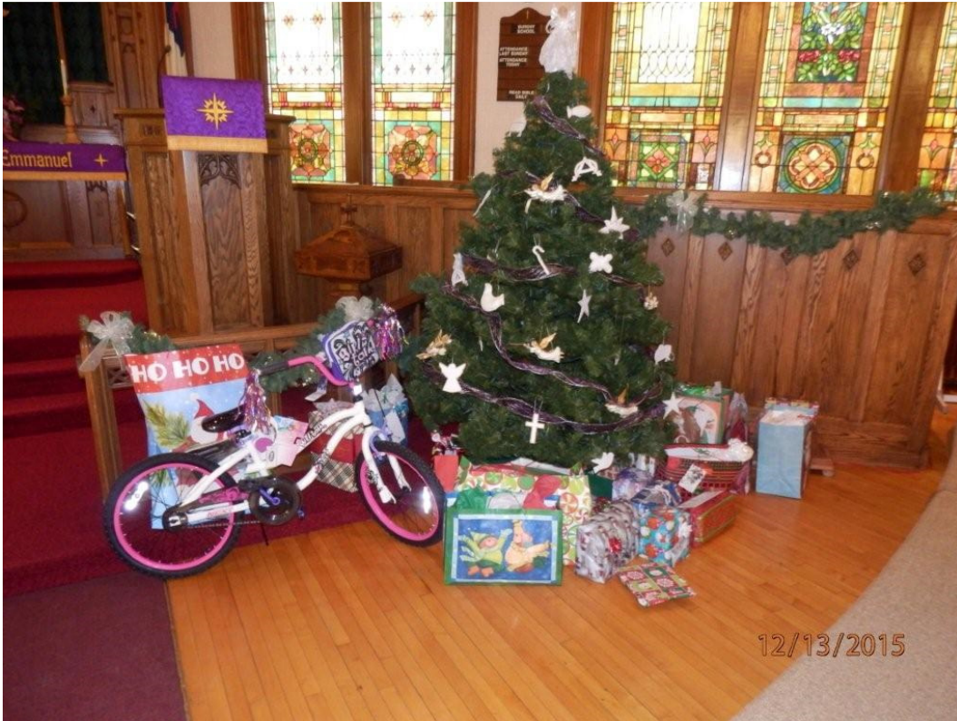
Angel Tree Gifts!