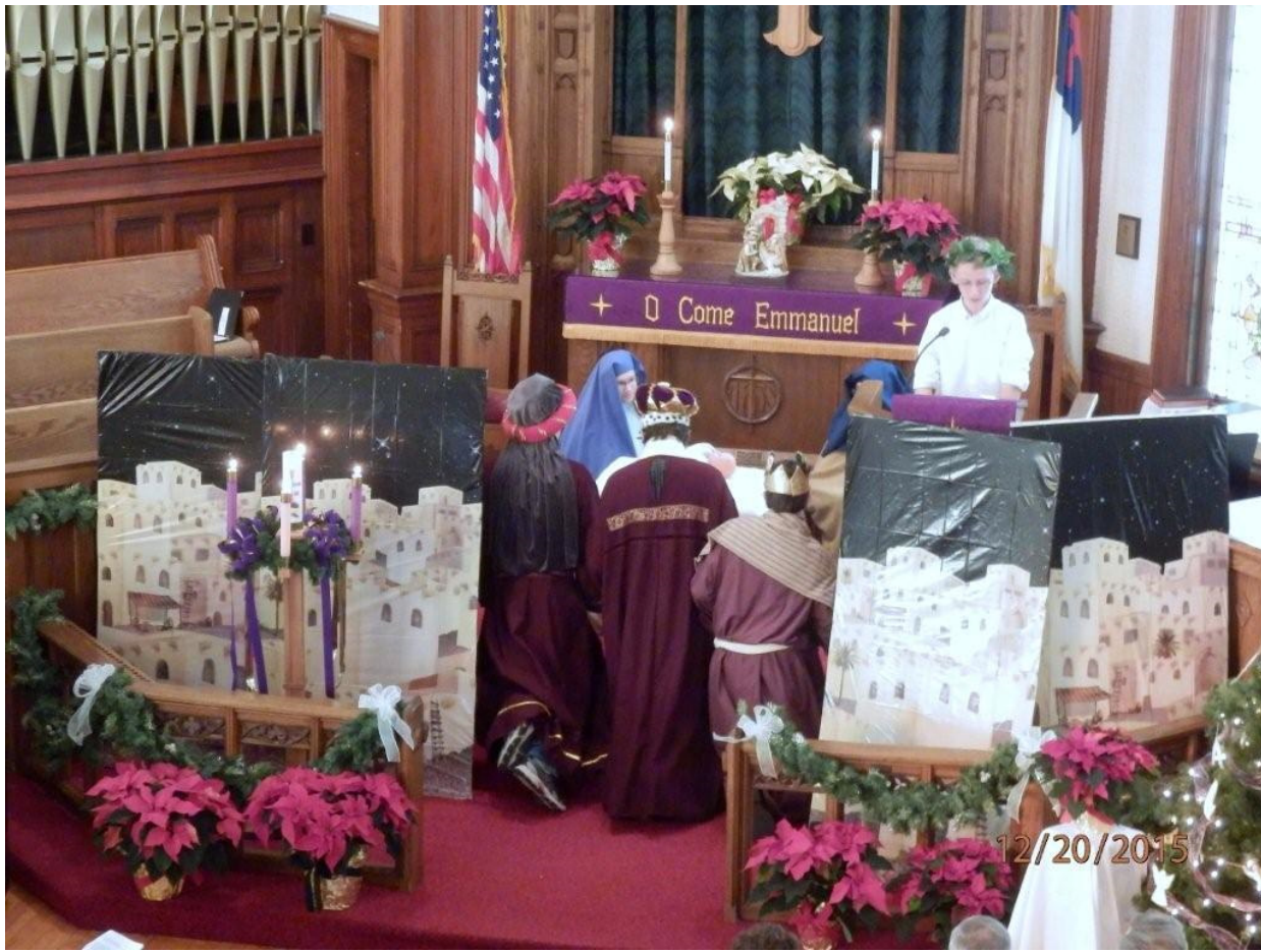
The Three Wise Men arrive at Jesus' crib!