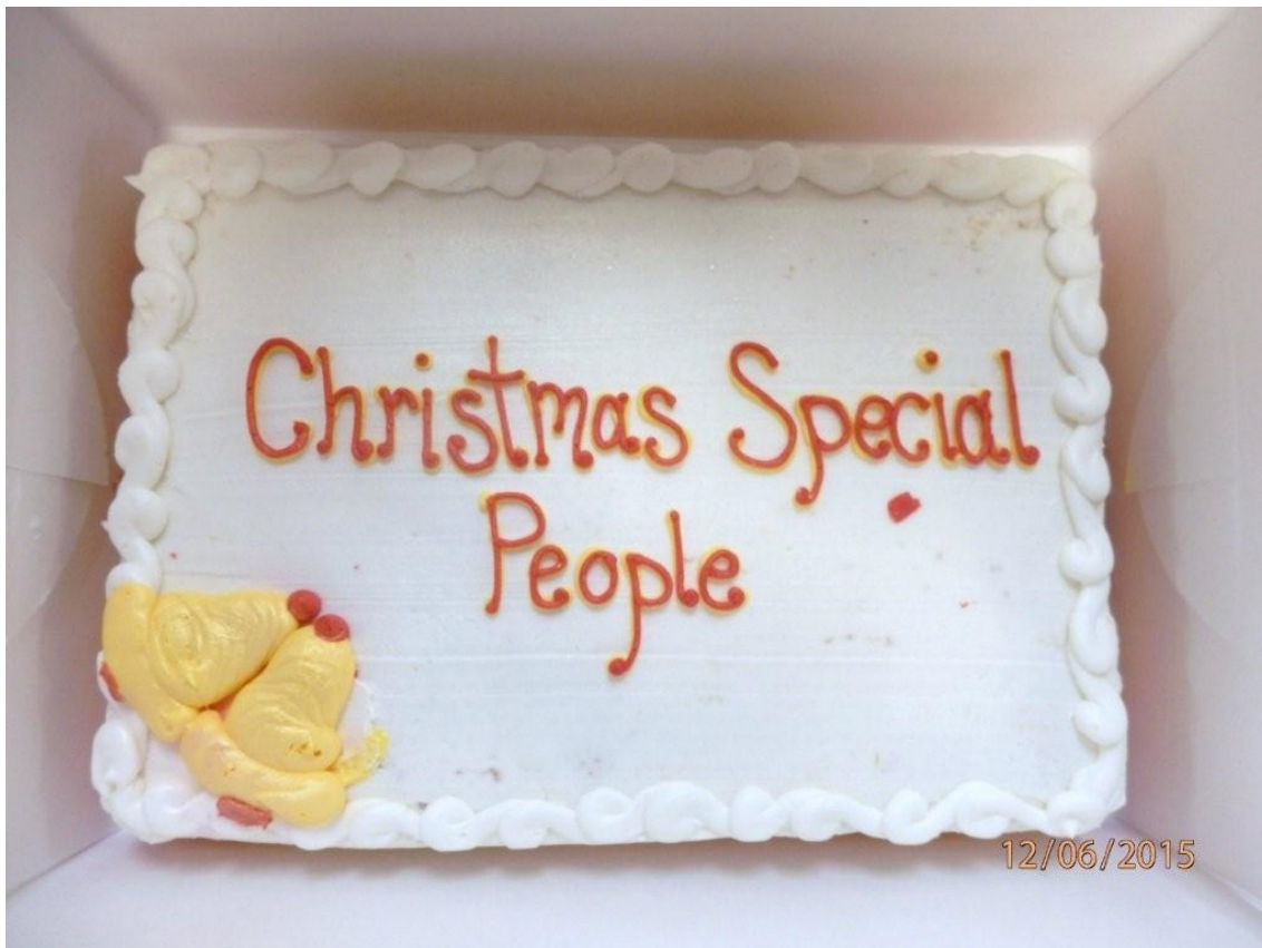
December Birthday & Anniversary Cake – December 6!