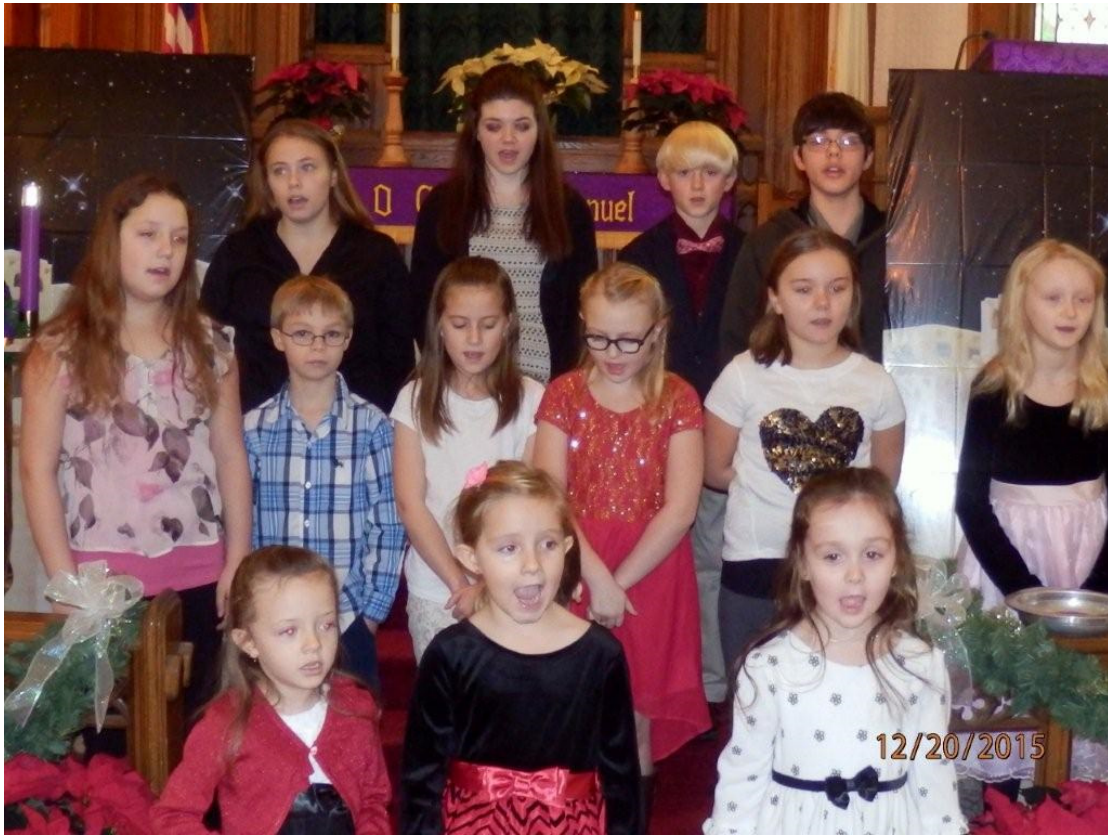
The Sunday School and "Terrific Tuesday" children practice for "The Christmas Story" play – Dec 20, 2015