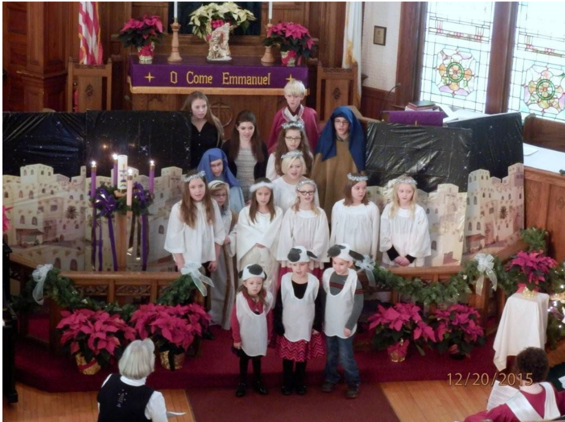
"The Christmas Story" scene with the children singing!