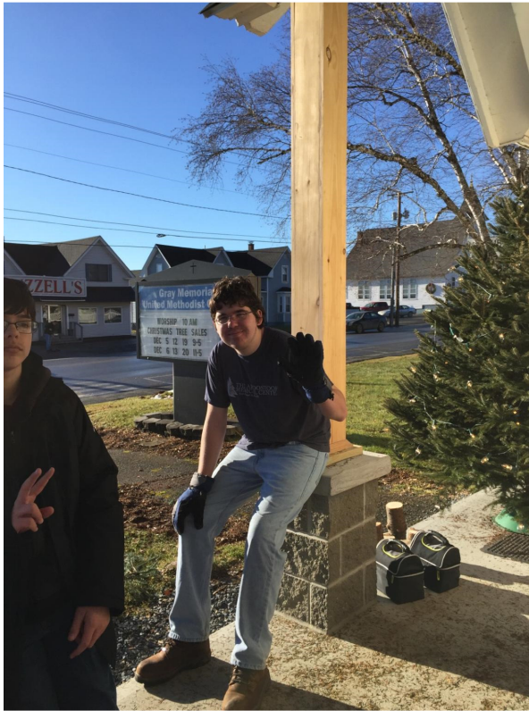
December 12th.....working in tee shirts selling Christmas trees! (What a difference in weather!)