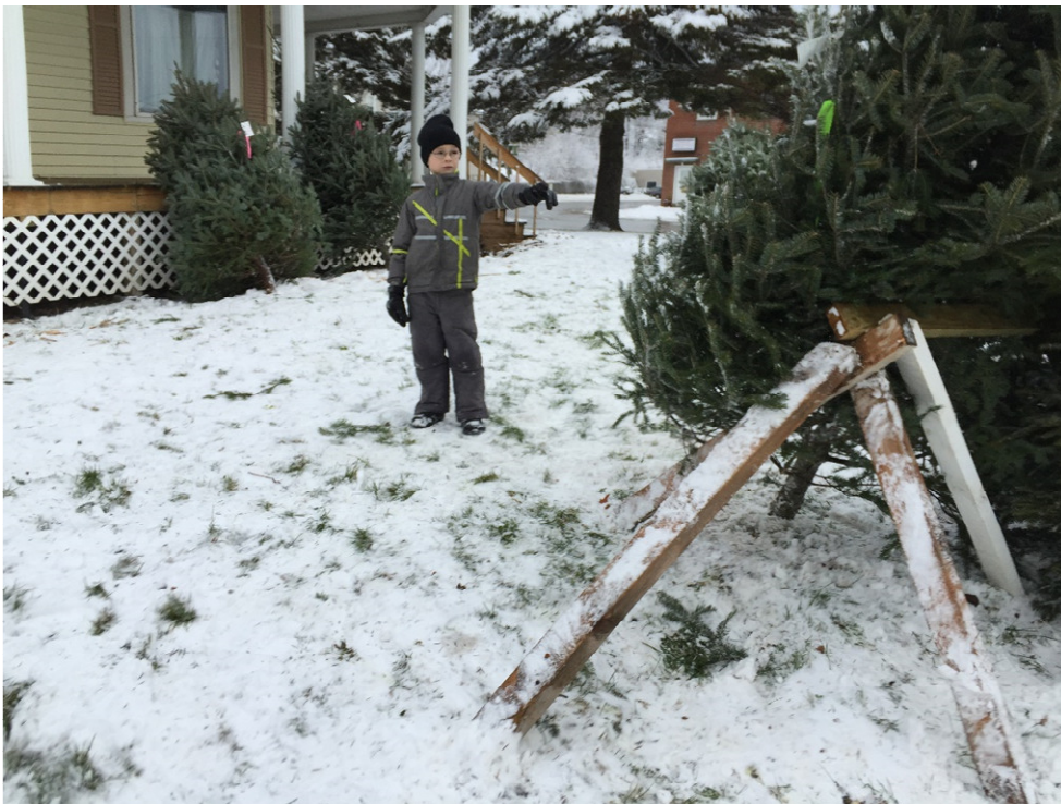
Eyzic helping with Christmas Tree sales on Saturday, December 5 th !