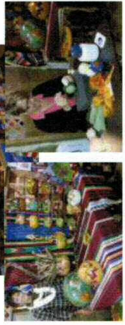
1900's Main Street