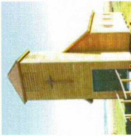
Little Cedar Church