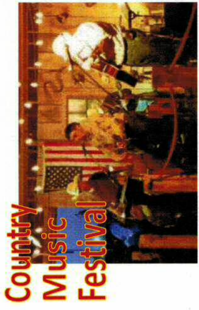
Country Music Festival