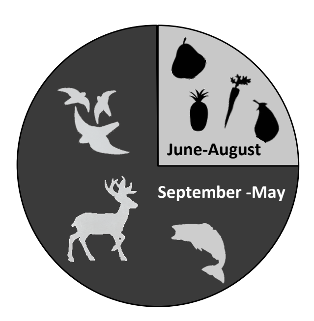
Our Ancestral Diet. For 39,900 years the human race survived on three sources of food for <sup>3</sup>/<sub>4</sub> of the year: wings, legs and gills. Fruits and vegetables were consumed in the summer, when they were in season, and helped humans to gain extra body fat to "prep" themselves for the winter months.

To understand the LF 20/20 diet system you must first realize that we have been on this planet for over 40,000 years in our current physical bodies. For the first 39,900 of those years we had no refrigeration, grocery stores, canning, trucking, or fast food. The only food we had available to eat was what nature provided in the season in which it was available. When you examine food availabilities, you find that fruits, vegetables, and grain only grow May through August - then everything that grows out of the ground dies. Starting in September, nature provided you with only one food choice; it has legs, wings, or gills : animal proteins. Without refrigeration, canning, or shipping to move food around you had no other choice. This is the diet program our bodies were designed to follow. In fact, we put on an average of 20-50 pounds of body fat during the summer months as most fruits and vegetables are designed to make you gain huge amounts of body fat very quickly. To further understand the concept of our ancestral diet, we must examine the three food groups: Fats, Proteins, and Carbohydrates .