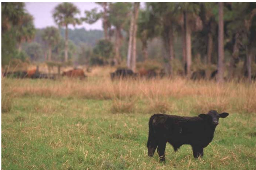
Promoting rotational grazing addresses soil erosion, an important resource concern.