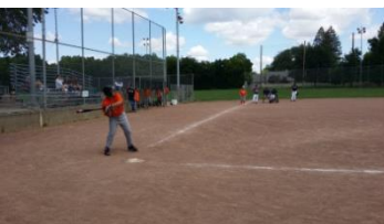
Put Me In Coach