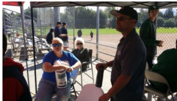
Pinole Hercules Cotton Candy