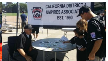
Free Baseball Cards