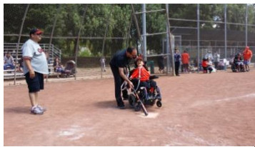
Coach Giving Signs