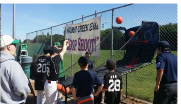
Warriors Training Center