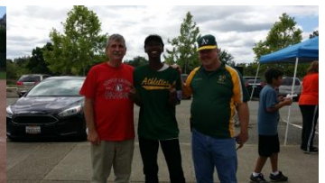
The Big 50/50 Winner