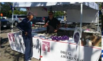
Volunteers From The Elks