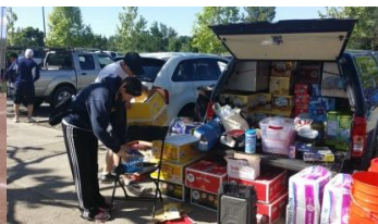
The Big Heist