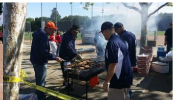
No Smoking Allowed