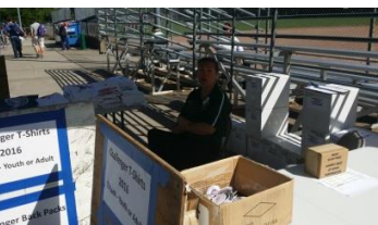
Challenger Team Packages