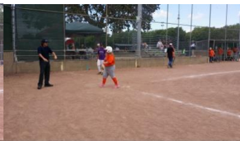
Run Score, Score That Run