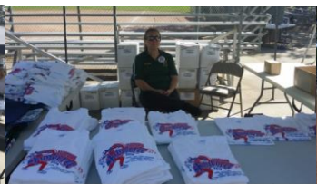
2016 Jamboree Shirts