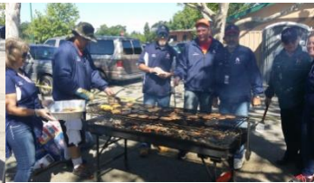
Antioch BBQ Crew