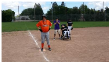
Dynamite Third Baseman