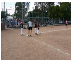
Close Play At The Plate