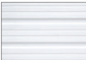
Ice White With grooves