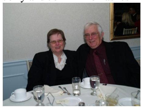
Volunteer of the Year 2019