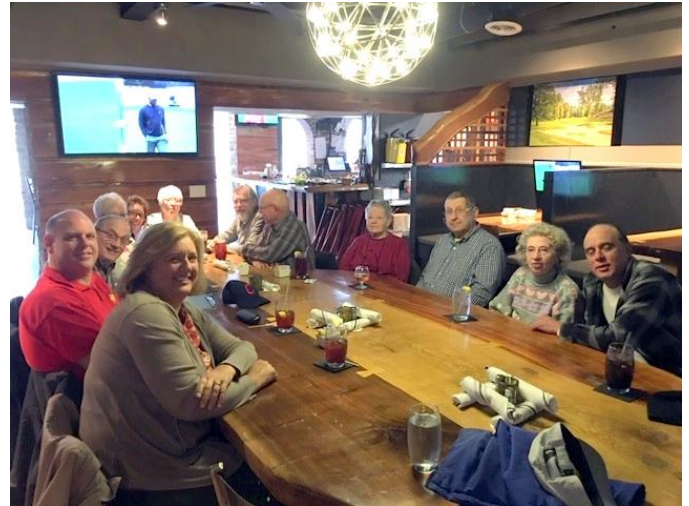
Having a great lunch at Black River Tavern . Food & friendship was outstanding!