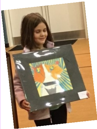
Student art show winners above