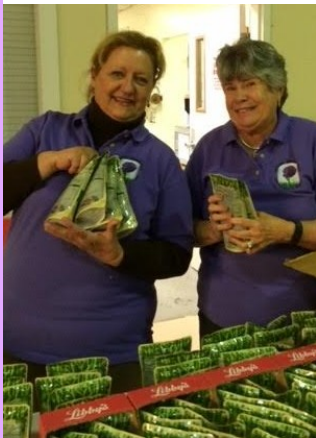
YWC helpers at Palmer Mobil Food Pantry distribute food as part of "Dare to Dream of No Hunger" project.