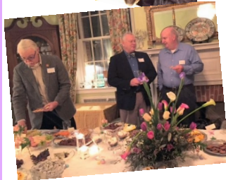
Pictures from the 2016 Chocolate Event show (top) a beautiful table of goodies, (center) "keepers" of the raffle table and (bottom) guests enjoying the bounty of sweets and savories