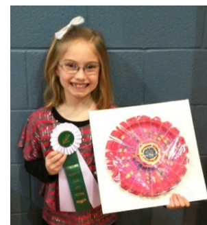
Below, A big smile from one of our 2016 Best in Show award winners.