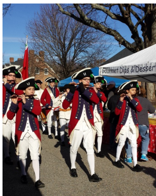
Yorktown Fife & Drums perform at Market Day parade.