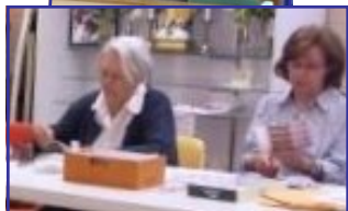
YWC ladies gathered on April 26th to craft centerpieces and table favors for the GFWC State convention to be held May 6-8 in Williamsburg.