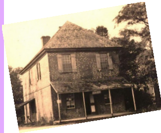
Do you recognize this building? Learn why it is so important to Yorktown at our March meeting.