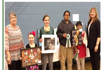
Below, 2015 Best in Show student winners pose with their artwork