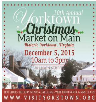
Christmas items hand-crafted by YWC will be on sale at this event