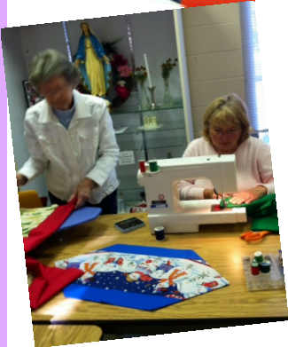
Crafters at work making decorations for the Yorktown Christmas Market.