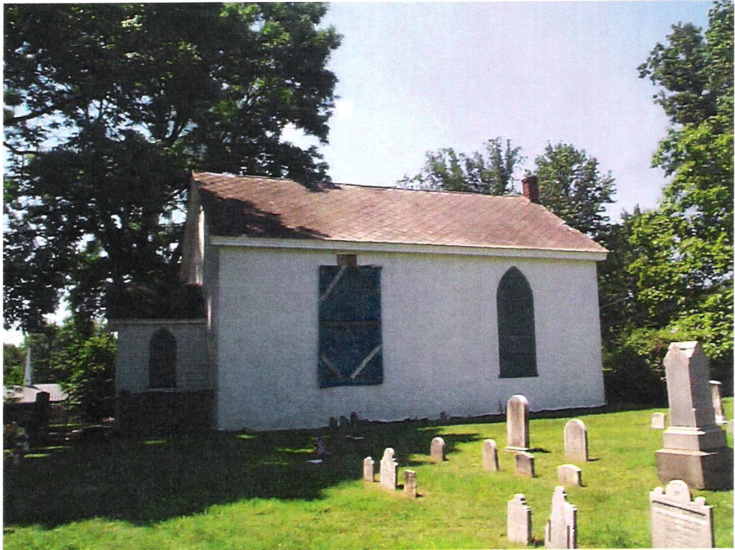
Newark (Union) Meeting House, with Union Cemetery around it. Valentine Hollingsworth donated the first quarter acre of land for use as a cemetery.