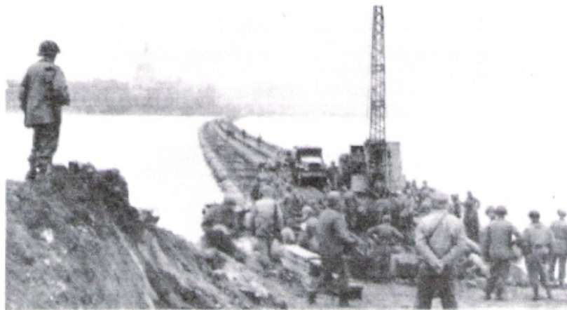
The 160th Engineer Combat Battalion built the longest tactical bridge across the Rhine at Mainz, Germany, 23 March 1945.