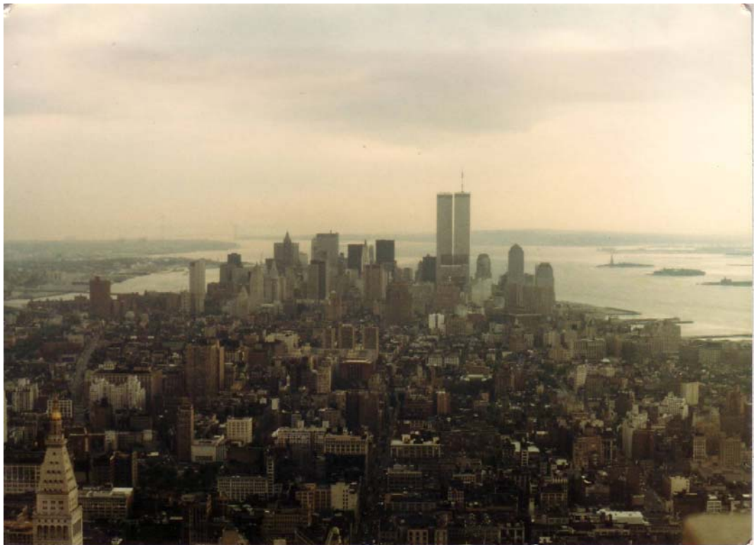
Picture taken from the top of the Empire State Building (note: Twin Towers)