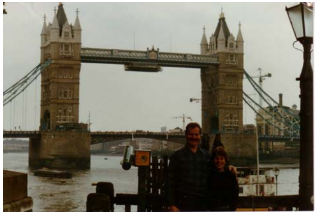
The Tower Bridge