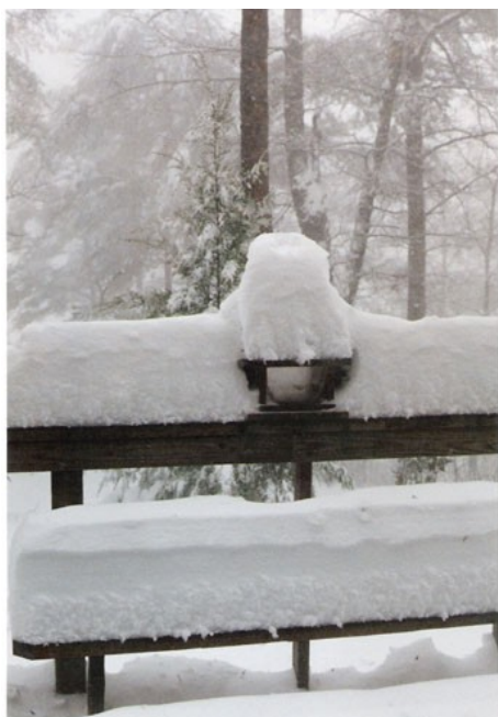
This picture is of the back deck area

This particular weekend turned out to be the "Storm of the Century." By morning, several feet of snow had fallen around the cabin and temperatures dropped to below zero at night. They were stuck in the cabin with no way down the mountain and very little food to eat. Family members back home knew, as they heard the weather reports, that Wayne and Shan were not prepared for such bad weather and were in possible danger. They convinced the local Rescue Department to try and reach us and bring us down the mountain. They were unable to do so on Sunday. Monday morning, after spending 2 days and 3 nights trying to stay warm and only having 2 cans of soup to eat, the Rescue folks were able to use a 4-wheeler to make their way up part of the mountain and then hiked the rest of the way up to find us. Wayne and Shan grabbed a few things and the Rescue folks took them to a First Aid shelter where they called worried family members to tell them they were ok.