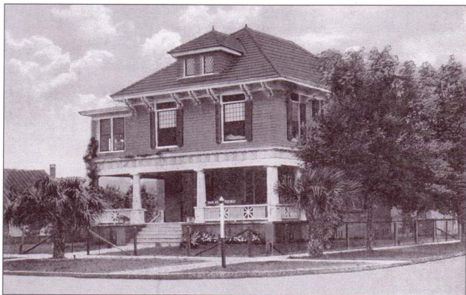
Fernald-Laughton Hospital, once a private residence, served Seminole County until 1956.

This home was donated to Seminole County by two families, Fernalds and Lawtons to use as a hospital in 1919. There were 5 private rooms and the house was large enough to accommodate 35 beds and one operating room. The operating room was in the old hall of the residence and an elevator connected directly to the operating room. The elevator was run by a rope and prior to surgery the surgeon or someone had to pull the patient up and down the elevator to surgery and then back upstairs to their room. The hospital was located on the corner of 5 th Street and Oak Avenue. A bed in the main ward cost $5.00 a day, private rooms were $7.00 a day. The operating room charge was $5.00 for the first hour for minor procedures and $10.00 for major ones and $5.00 for each hour thereafter.