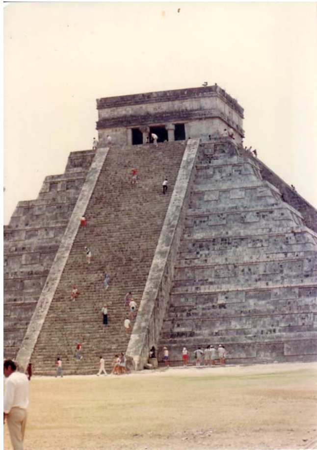
We walked to the top of this Mayan Pyramid called Chichen Itza near Cancun