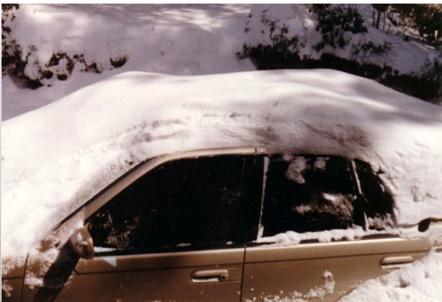
This picture is of our car after I scraped snow off to try and get in

After our rescue, we rented a car and drove home to Valdosta, GA. A week later, we drove back up to get things we had left in the cabin and our car. Thankfully, almost all the snow had melted by then.