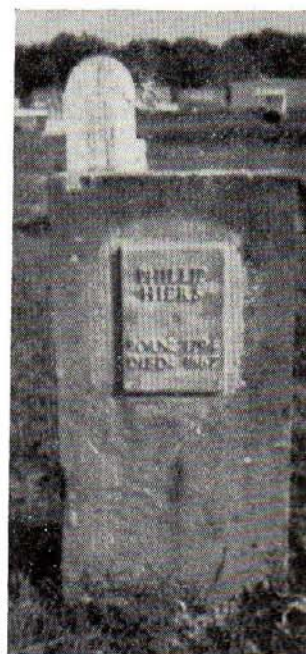
GRAVE STONE OF PHILLIP HIERS (b 1794, d 1887)