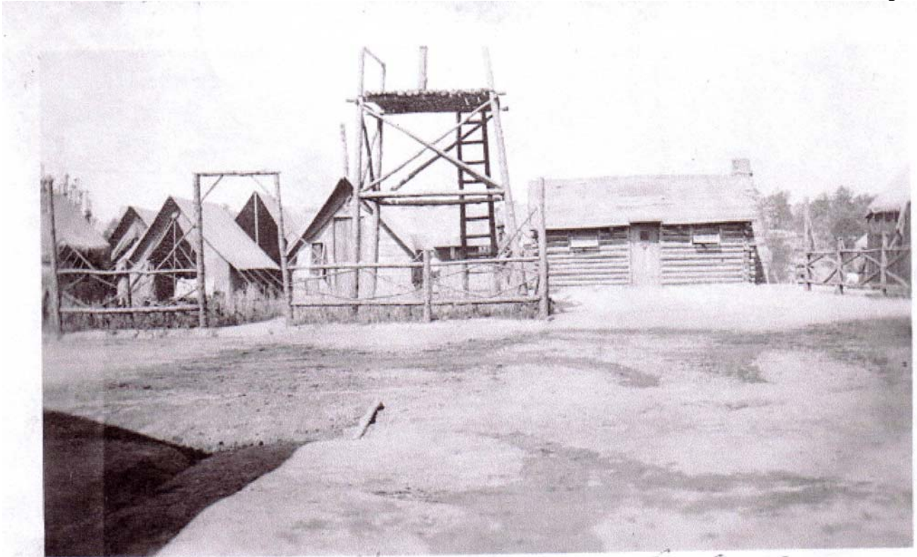
Camp Wadsworth S.C. 1918