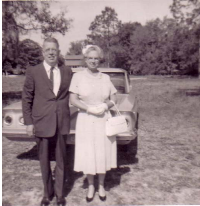
Older pictures of Grandpa & Grandma Hiers