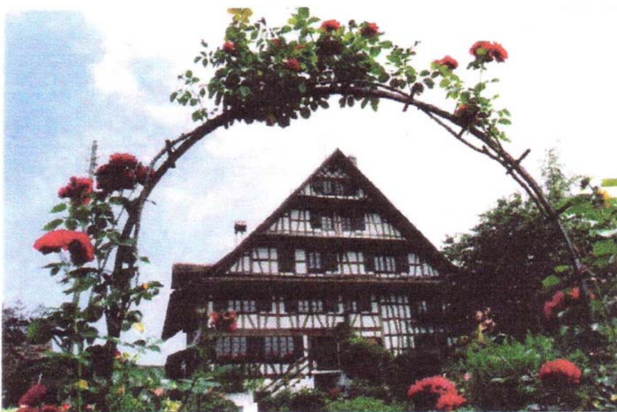
Photograph of Nafenhaus in Kappel am Albis, Switzerland

http://freepages.genealogy.rootsweb.ancestry.com/~neff/photo_album.htm