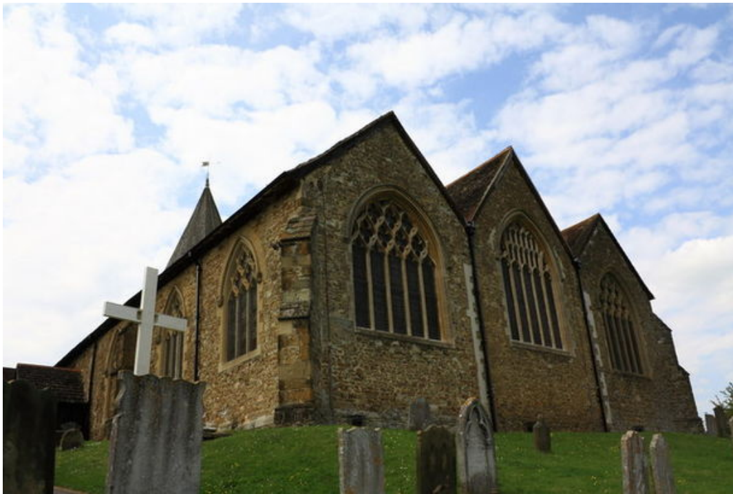
Westerham Parish Church