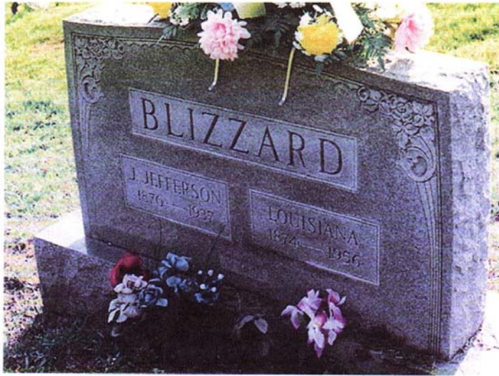
Lousiana Dotson Blizzard buried in Bradshaw Chapel Cemetery, Church Hill, TN