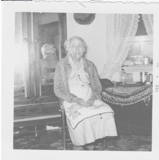
This picture was taken one year before her death