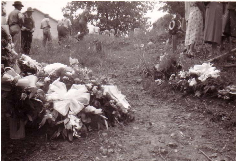
This picture was taken at the funeral of Louisiana in 1956. Bradshaw Chapel can be seen in the background.