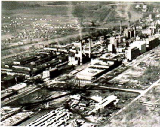
Eastman Plant circa 1950