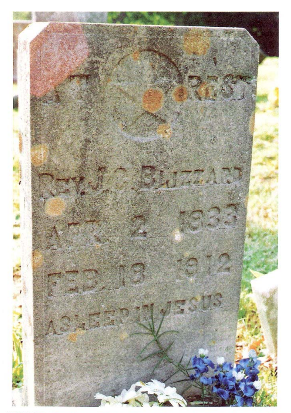
BURIED IN BRADSHAW CHAPEL CEMETERY, CHURCH HILL, TN