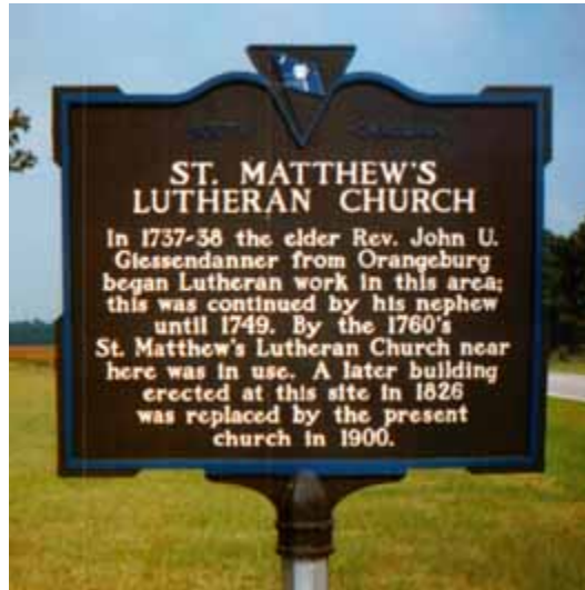
St Matthew's Lutheran Church historical marker