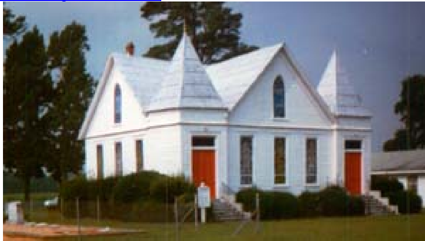
Above is picture of St Matthew's Lutheran Church as seen today.

http://sail.home.xs4all.nl/orange/a-index.html