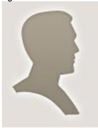
No Picture Available

Born: Dec 1640 Pfalzgrafenweile, Schwarzwaldkreis, Baden-Wuerttemberg, Germany