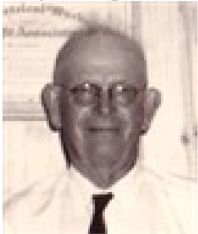
Born: 8 Jan 1893 Brunson, SC Died: 28 Jan 1985 Monroe, FL