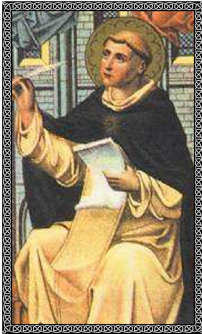
SAINT THOMAS AQUINAS Patron of Catholic Education