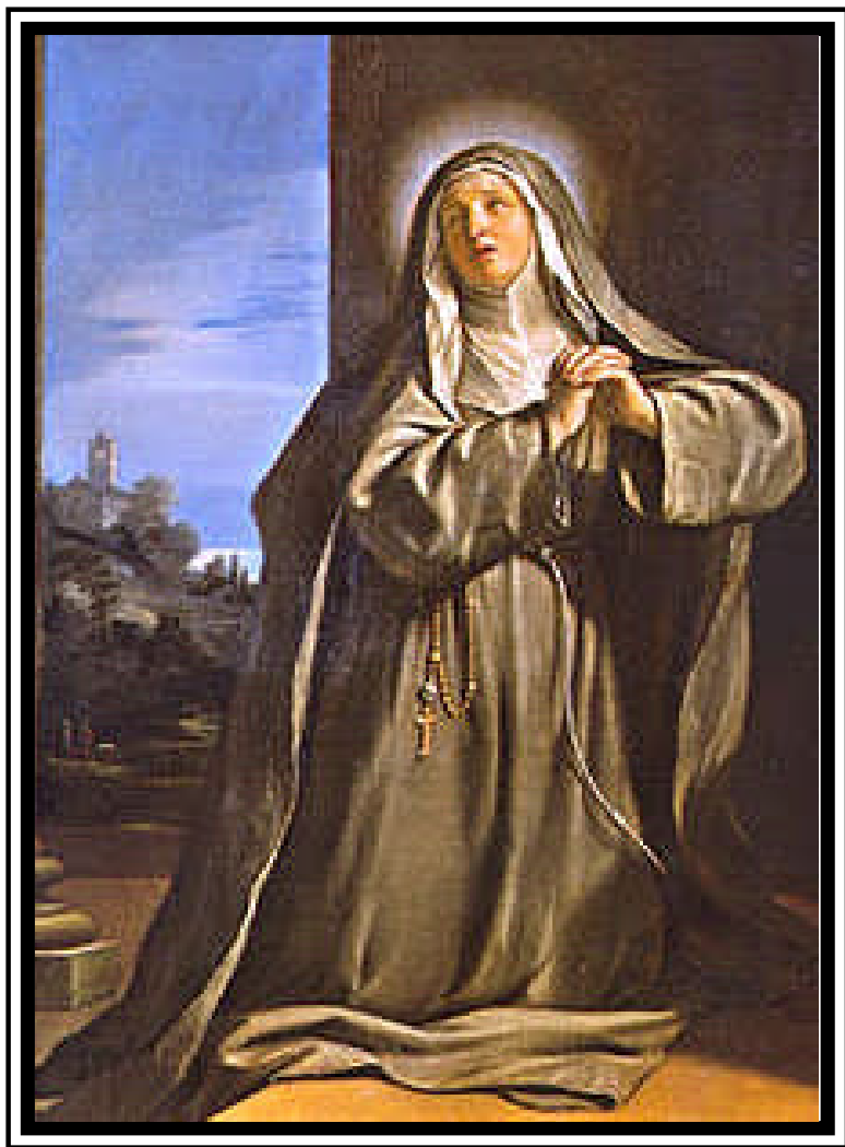
St. Margaret of Cortona