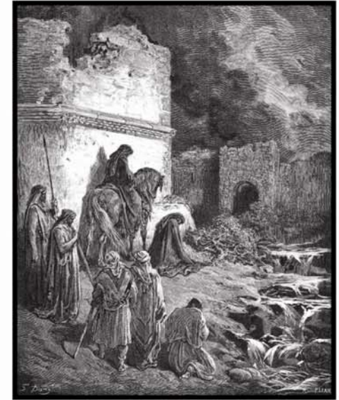
Returning to Judah from Exile in 445 B.C

To name a few according to scripture, Daniel, Ezra, Nehemiah and Esther were in Babylonian captivity. Considering the monthly cycle from the Babylonian calendar is identical to the Hebraic calendar, these four mentioned individuals did not have any issues on keeping the 7th day sabbath according to the 4th commandment.