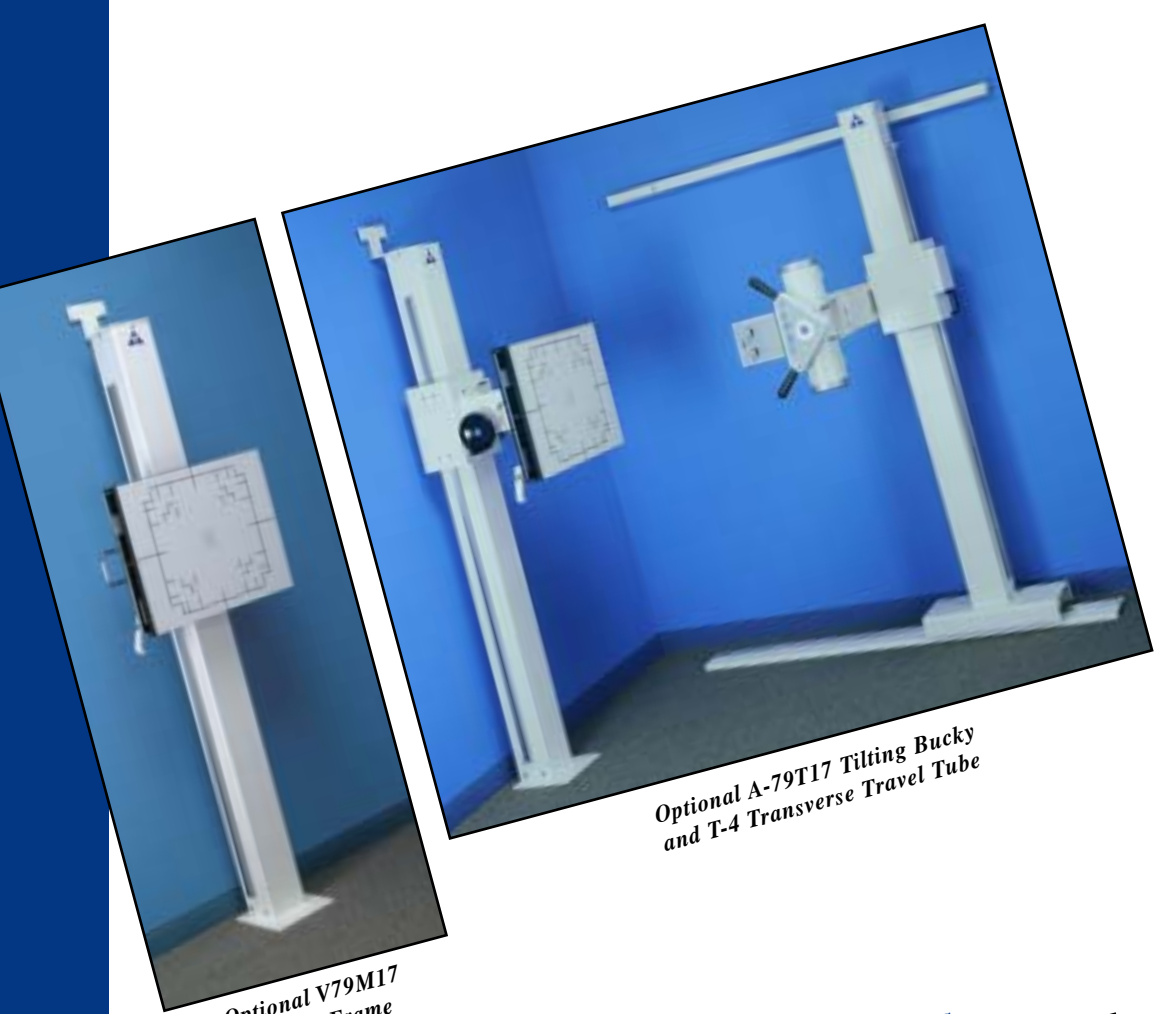
Optional V79M17 Upright Frame

The future will certainly bring changes to the radiographic industry. Manufacturers are making great strides in developing new film/screen combinations and perfecting digital radiography. The future holds implementation of new technologies into existing chiropractic offices. The x-ray generator will determine the capabilities and limitations of the x-ray system. HCMI 100 kHz generators combine numerous mA stations, a quartz accurate timer and 100 kHz technology to insure complete system compatibility with future imaging technologies. No other x-ray generator offers more mAs combinations than the HCMI 100 kHz generator. An HCMI 100 kHz x-ray system will meet today's needs and undoubtedly will meet the needs of the 21st century.