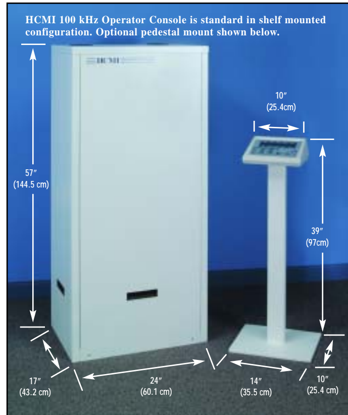
HCMI 100 kHz Operator Console is standard in shelf mounted configuration. Optional pedestal mount shown below.