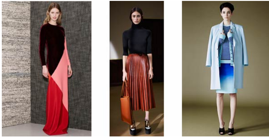
Prefall looks from Stella McCartney, Celine and Jonathan Saunders

Forget summer; prefall is here and selling fast. Experts pick their favourites from the new collections