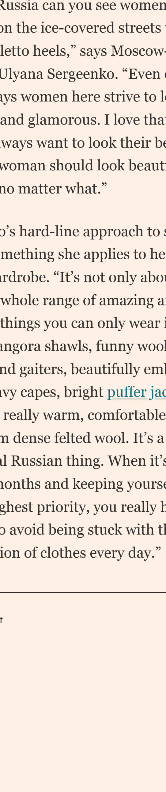
Designer Ulyana Sergeenko says: 'Only in Russia can you see women casually strolling on the ice-covered streets wearing a pair of stiletto heels'

When the wind blows in from Siberia it's easy to throw style out the window and bundle yourself up like some latter-day babushka. But is it possible to look cool and keep warm when the temperature drops below freezing? Consider the following advice from our friends in the (very far) north.