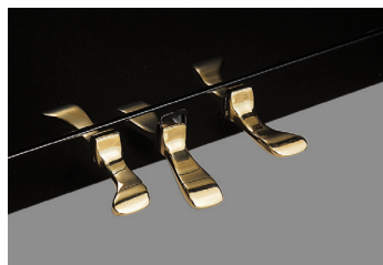
In our grand pianos, a hand lever activates and deactivates the acoustic silencing mechanism. In Schimmel uprights this function is operated by the middle pedal.