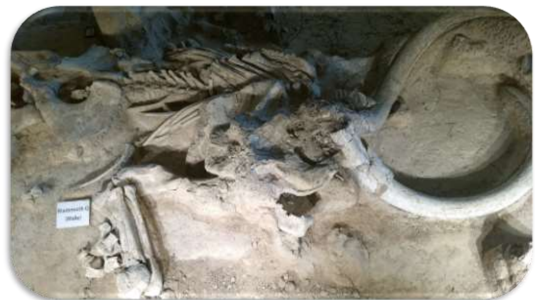
Continued on page 6.

These animals thrived 65,000 years ago in herds in the grasslands of central Texas until 10,000 years ago when they all disappeared. This event included all the mammoths, camels, saber-toothed cats, giant bison, sloths, turtles and armadillos (the size of a VW). It is unclear what caused this mass extinction, but it is believed climate change may have had a part in it.