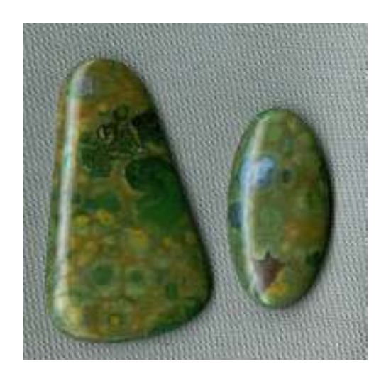
Rainforest Jasper

This material is somewhat akin to thunder eggs, also found in the area. In that the magma that is responsible for the formation was very heavy sinking much lower than the lighter magma above. This permitted slower cooling of the magma allowing the various colored phenocrists to form together. The coloration of these phenocrists vary significantly from green, yellow, red, orange, blue, cream, white, and brown. These phenocrists vary in shape to spherules or orbs to irregular shapes. This gives the material very unique patterns, providing beautiful gemstones. These are showing up in the hobby as beads, cabs, and, bookends just to name a few. This material was first brought to market in 1986 by Bert Kayes, who had been mining chrysoprase nearby since 1963. 1. While the material is quite new to the hobby it is gaining popularity swiftly. The material that I have worked has turned out well.