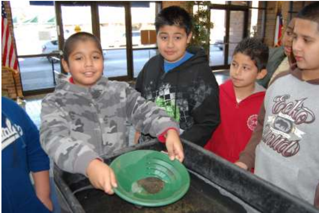
GOLD PANNING ANYONE?

THIS MONTHS' ISSUE WILL BE DEVOTED TO PICTURES TAKEN AT THE SHOW.