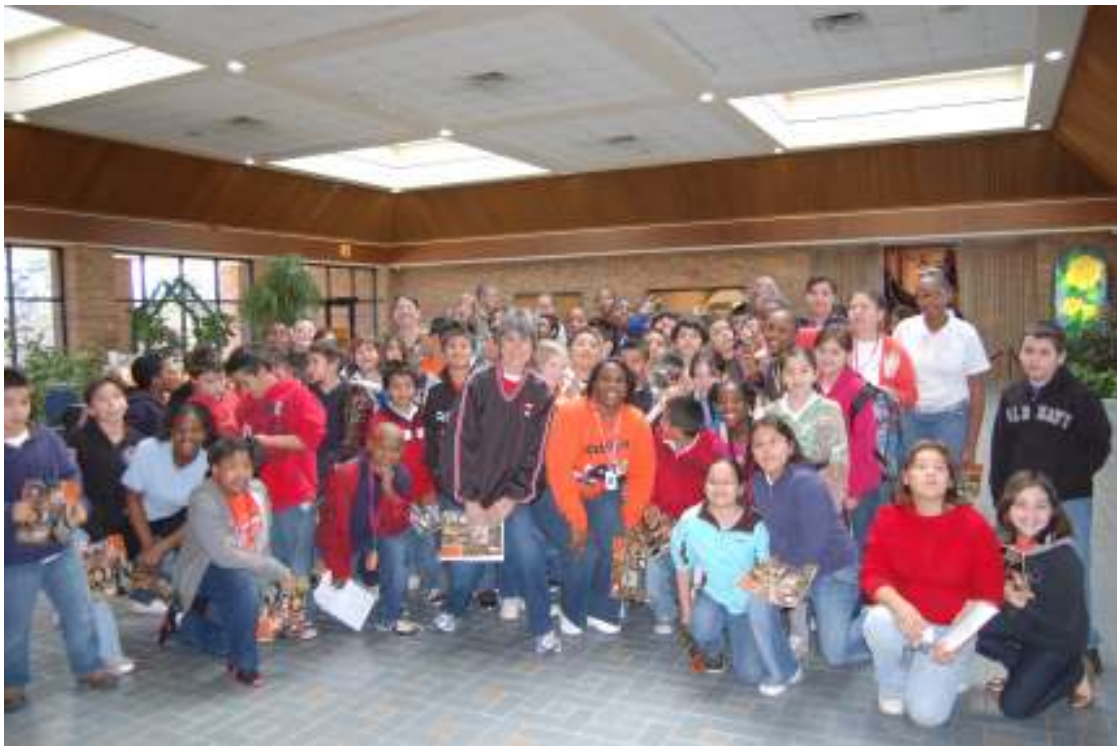
A GROUP SHOT OF SOME OF THE 5TH GRADERS WHO ATTENDED