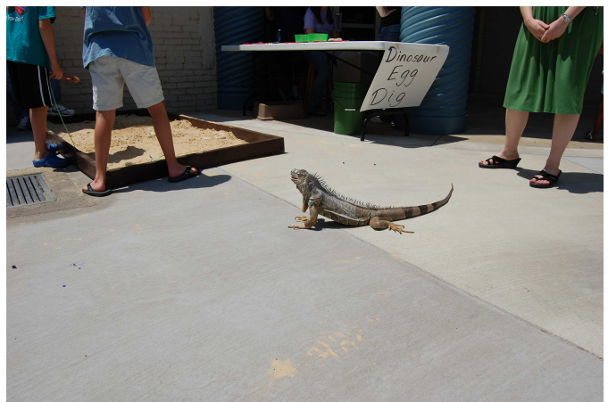
Kiwi the Iguana is pictured here overlooking the dinosaur egg dig. Eggs containing 'baby dinosaurs' were unearthed, tools were used to crack them open, revealing a treasure to take home.