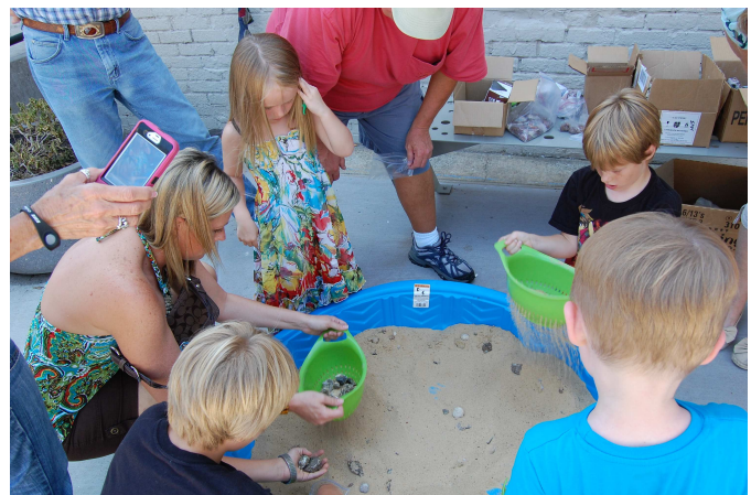
Children were provided with sieves to sift through the seeded sandpit to find crystals, mineral specimens and small fossils.