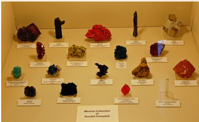
Middle left: Mineral specimens By Don Campbell