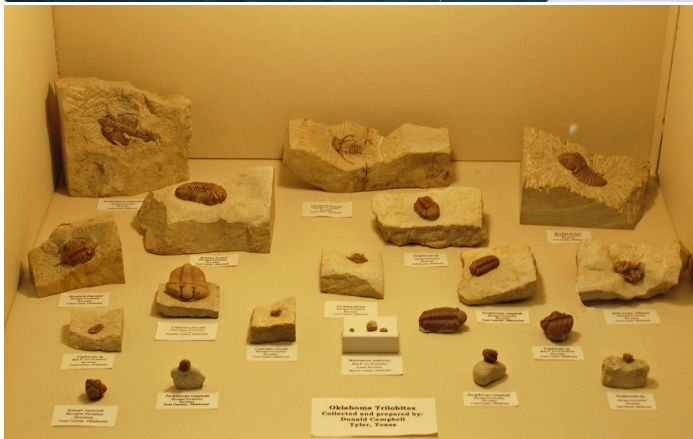
Left: Trilobite fossils in matrix By Don Campbell