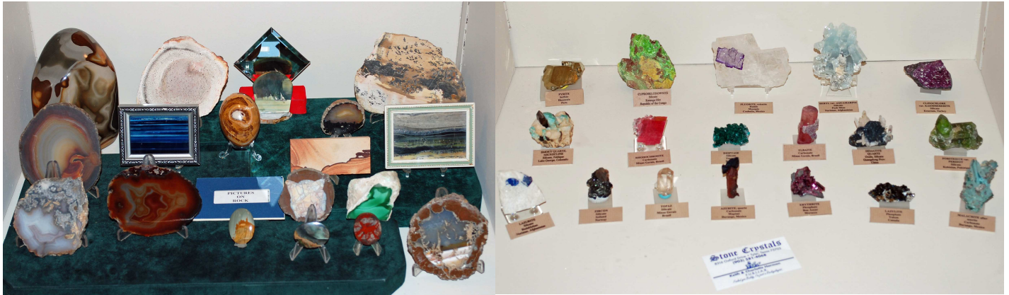
Upper left: Pictures on rocks