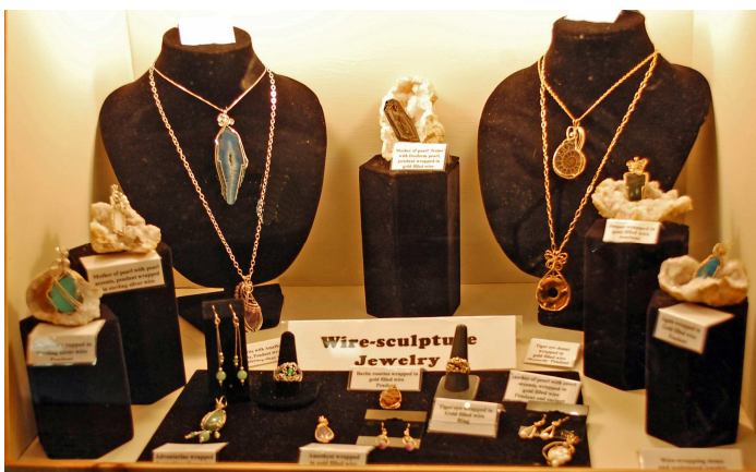
Bottom left: Wire-sculpture jewelry display By Susan Burch