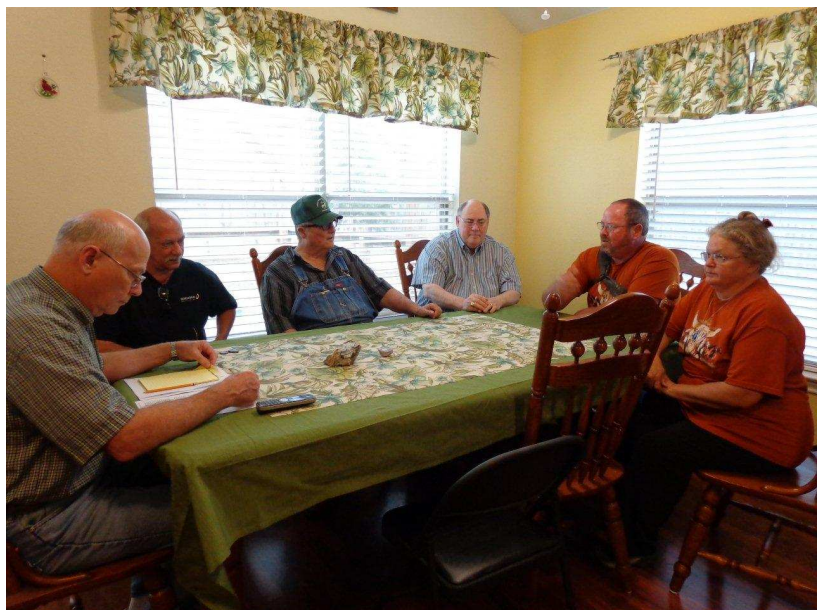
Photo at right: The first meeting of the lapidary/ jewelry sub-group...the 'rectangle table discussion'

Respectfully submitted Suzan Chapman, Secretary, ETG&MS