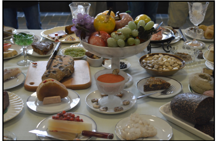
The 'fruit and desert' portion of the Rock Food Table, looks good enough to eat!