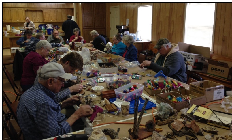
'Group Hard at work', January 10 workday at Bullard, Texas