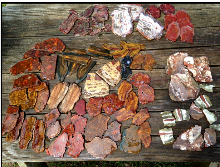
At left: Here's a picture of a few of the slabs cut from the material I collected on last field trip out west. The biggest group was collected at Lavic Lake area, to the right of that is Porcelain Jasper collected Hauser Geode Beds, and material at the top was collected north or Brenda, AZ. Kinney