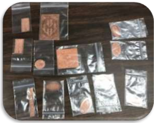
The three photos of the Lapidary/Jewelry group meeting are courtesy of Sonya Meinert.

we can give you a little more information on the group. The next meeting date is