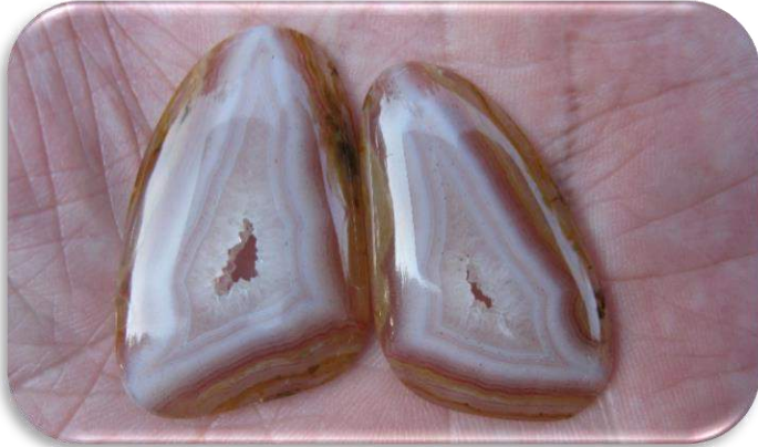
The two cabs above from one nodule may be a Coyamito agate according to Johnny French. The agate below is particularly intriguing due to the complexity of the colors and patterns in the cab.