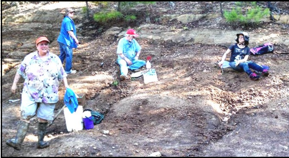
PICTURE FROM THE ELKHART SELENITE FIELD TRIP