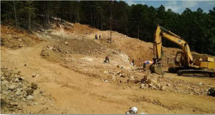
As we drove in, this is what we saw (above). They actually used the backhoe to open up some new areas for us... which our group was checking out (below).