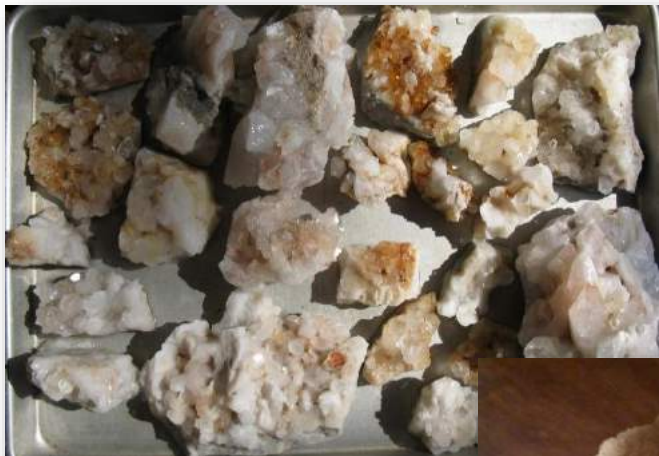
Overall, we found plenty of points and clusters in the rock, as well as in the tailings. Below and at right are some examples found.

The consensus was it was certainly worth the trip... everyone found plenty of crystal, cluster and points. The mine was very accommodating! They had the cleanest Porta John I have ever seen! They also walked around to see if you needed anything and provided water and umbrellas! As I said... very accommodating! I will definitely be going back to this mine! Happy Rockhounding!