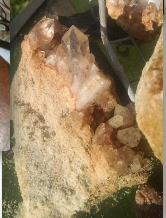
Photos above, left, and right are some more examples.