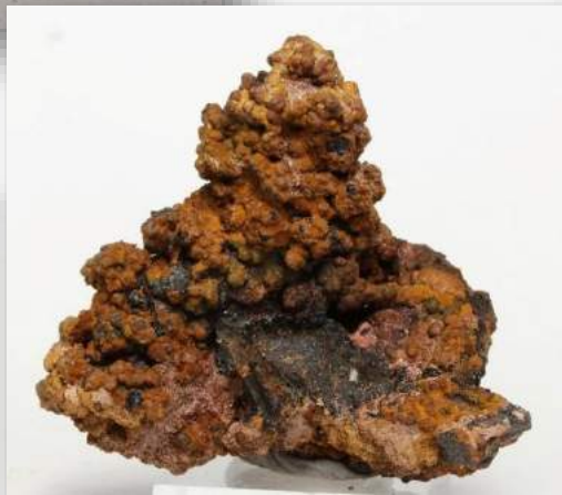
Above photo is Iridescent Hematite