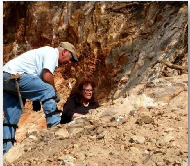
And in the top area... which after much work produced some nice specimens (above). We also worked on some exposed veins along the tree line (left).

Friday, September 15, 2017 was a beautiful day! Specially to head to the hills in search of rocks (any Rockhounds dream), in this case Quartz Crystal! Six of our members headed to Mt Ida, Arkansas that evening to get some rest before our dig the next morning at the Twin Creek Crystal Mine. We checked into the Crystal Inn in Mt Ida, which was clean and inexpensive. After having dinner at a popular local restaurant, El Diamante, we all returned for a good night's rest before the dig. The following morning, we met two more of our beloved Rockhounds at the Mt Ida Café for coffee and body fuel before heading out to the mine. So off we go on a beautiful Saturday morning! Our convoy of eight! The weather was hot and humid... but after all... we are Rockhounds! The dirt road to the mine was quite primitive but you could make it without a 4-wheel drive.