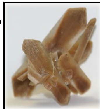
Selenite crystal cluster